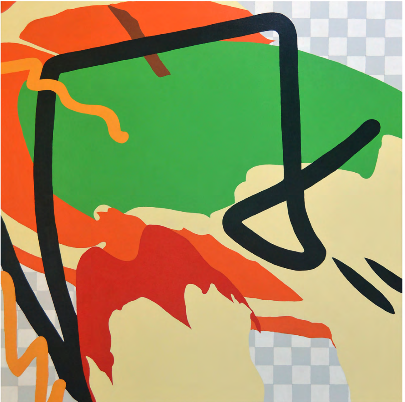
Assemblage #2, 2025 Acrylic on canvas 750 x 750 mm $1750