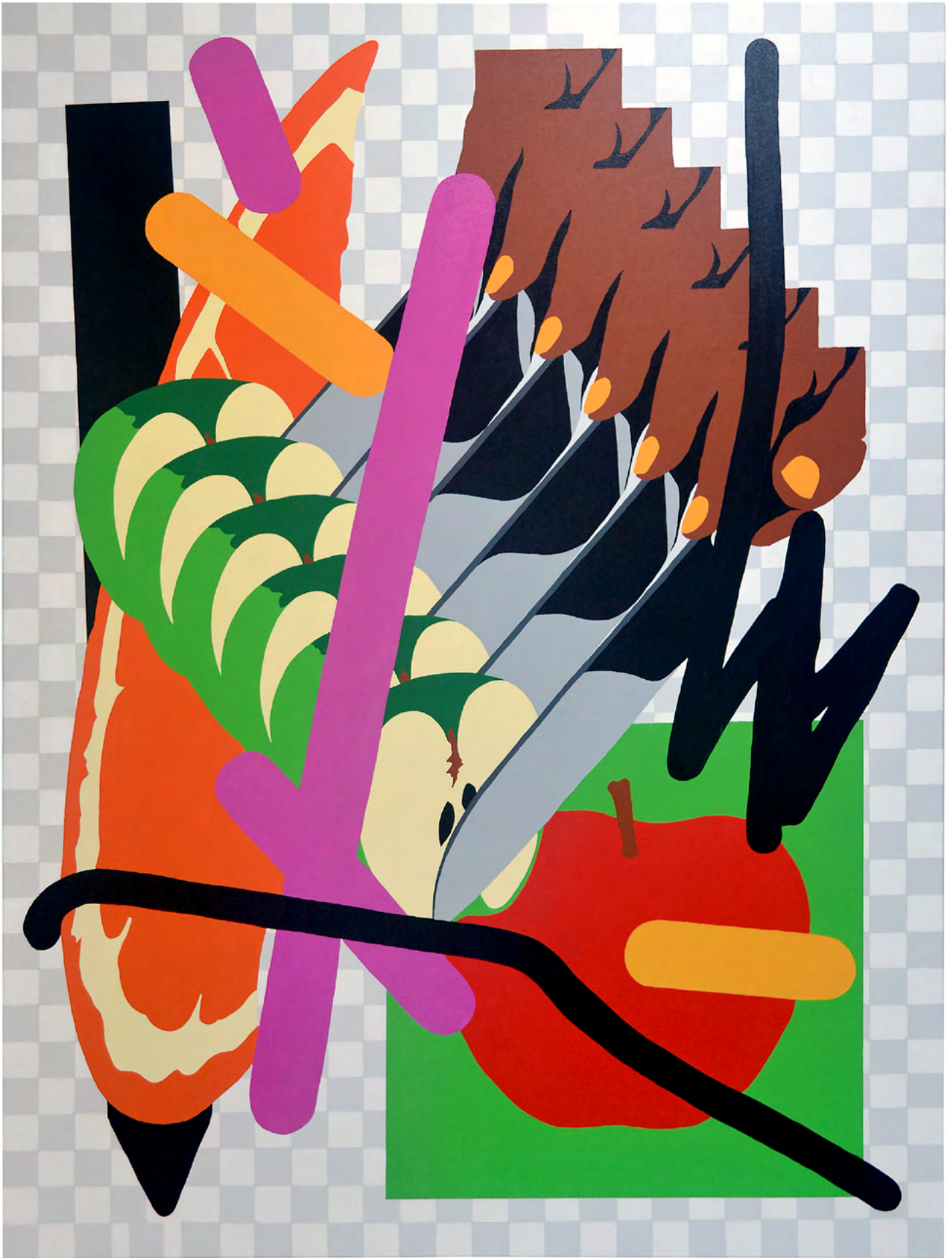
Assemblage #1, 2025 Acrylic on canvas 915 x 1220 mm $2750