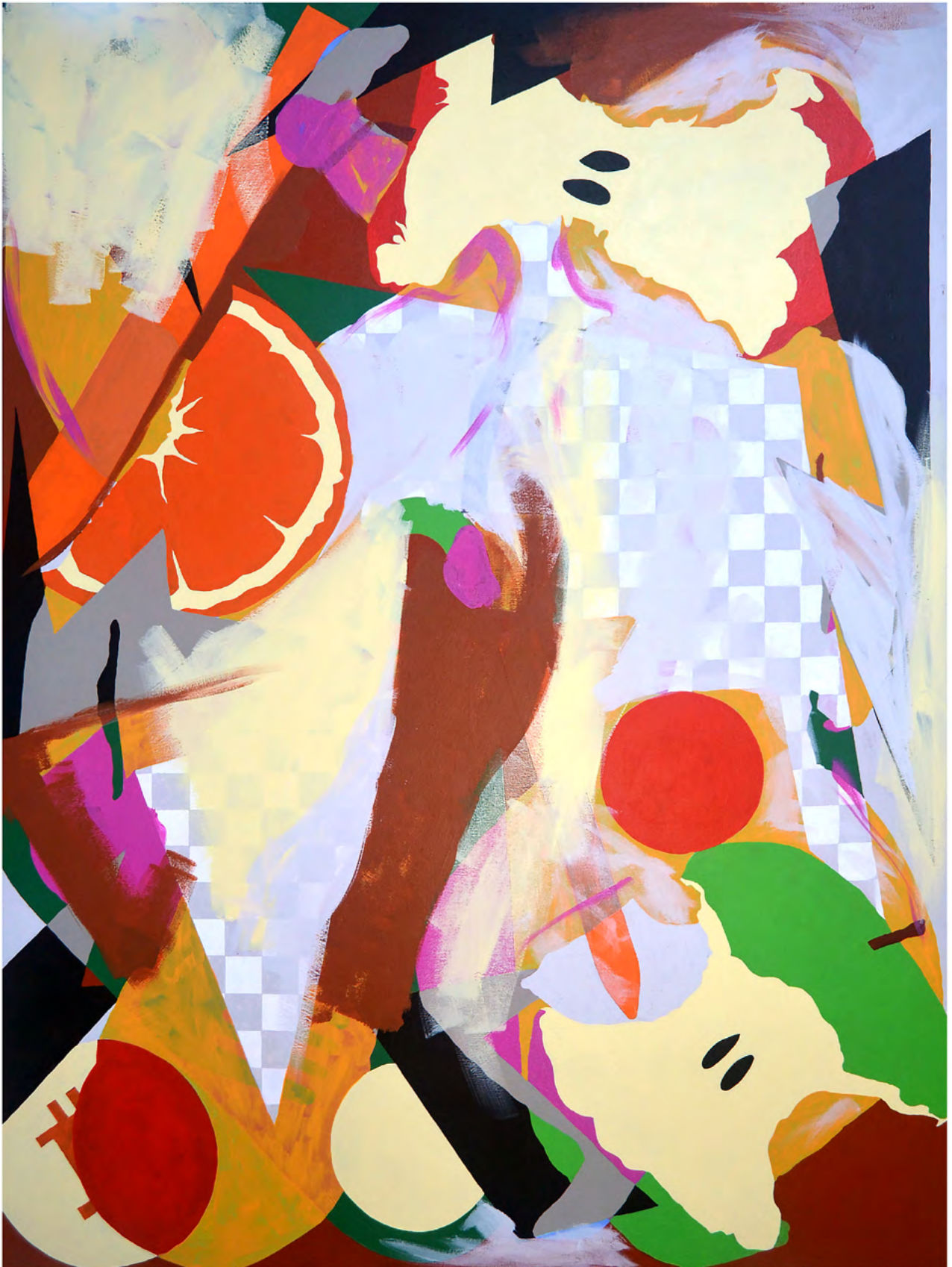
Fruit Salad, 2025 Acrylic on canvas 915 x 1220 mm $3000