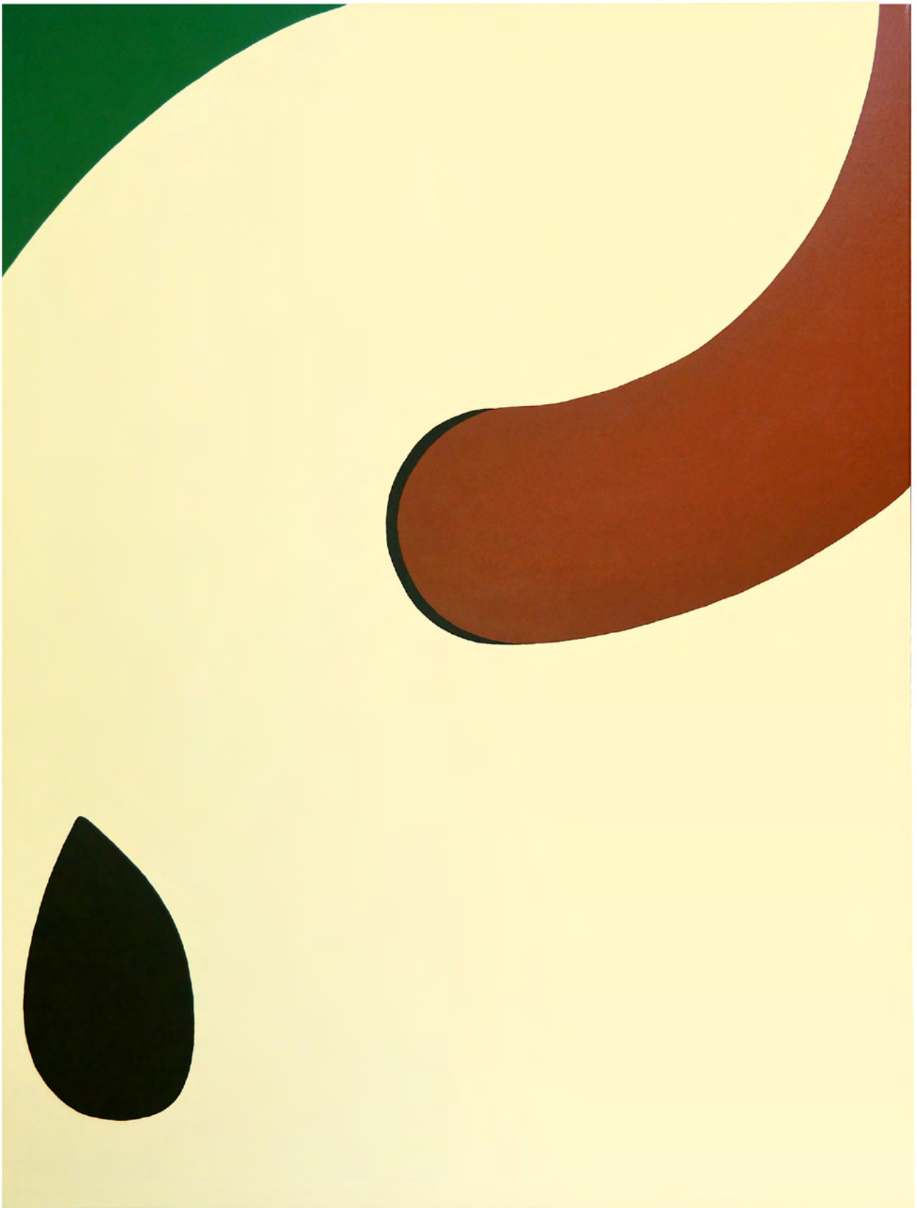
Wormhole, 2025 Acrylic on canvas 915 x 1220 mm $2500