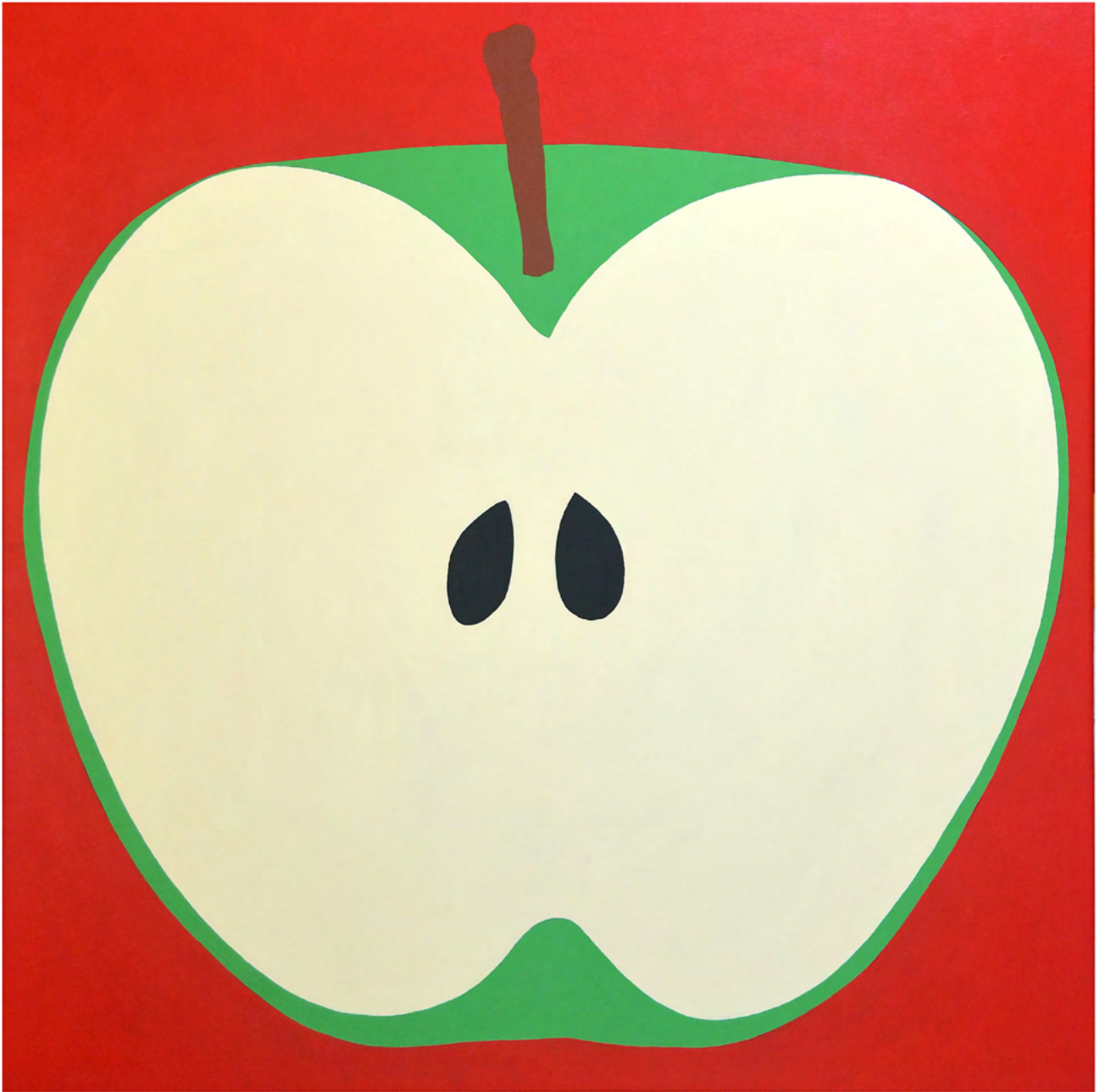
Full Moon, 2025 Acrylic on canvas 750 x 750 mm $1750