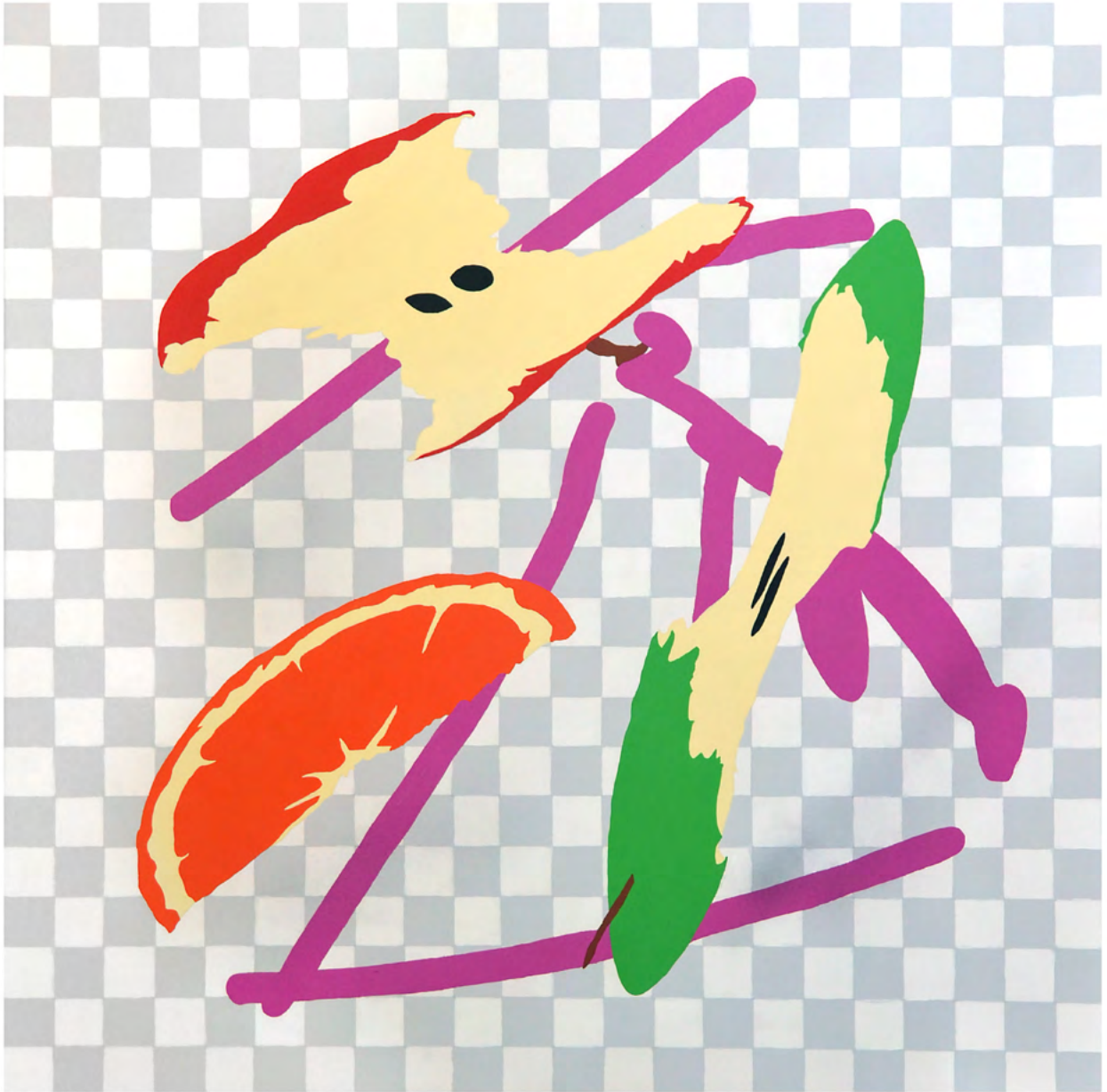
Pasteboard Eternity, 2025 Acrylic & Airbrush on canvas 750 x 750 mm $2000