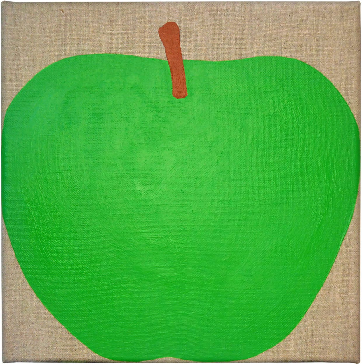
Crab Apple, 2025 Acrylic on linen 300 x 300 mm $865