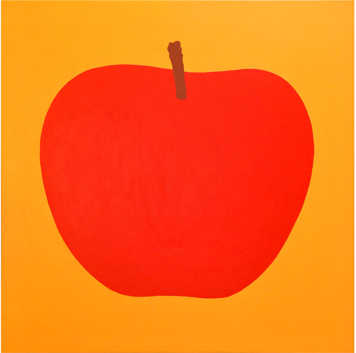
Cupertino, 2025 Acrylic on canvas 750 x 750 mm $1750