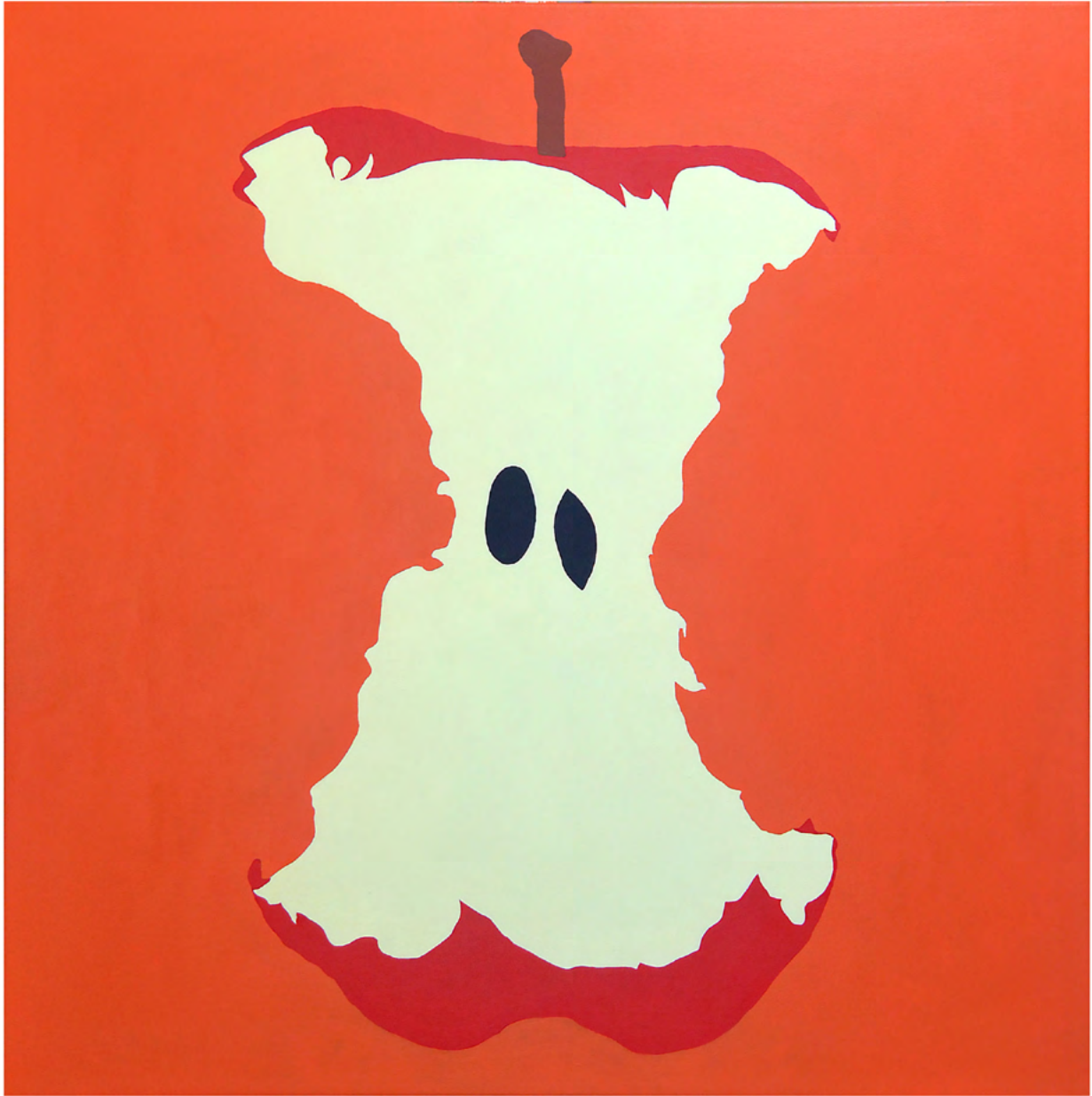
Hard Core, 2025 Acrylic on canvas 750 x 750 mm $1750