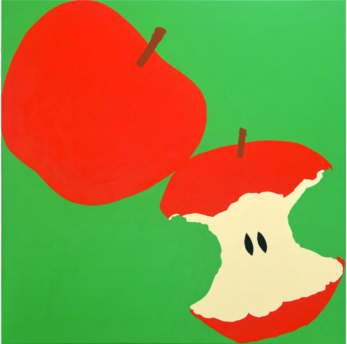
Trash & Nourishment, 2025 Acrylic on canvas 750 x 750 mm $1750